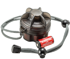
SC1 SPARE BATTERY CARRIER

Available in 2, 6, 12-packs and bulk options