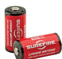
123A LITHIUM BATTERIES

Available in 2, 6, 12-packs and bulk options